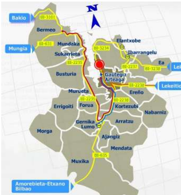
Map of the villages in Urdaibai Biosphere Reserve

The meeting will take place in the Urdaibai Bird Center. The Center was opened in 2011 and it is located in Gautegiz Arteaga, a small village located 40 minutes from Bilbao and 5 minutes from Gernika-Lumo by car. With a population of around 900 inhabitants, it is one of the 22 villages that form the Urdaibai Biosphere Reserve.